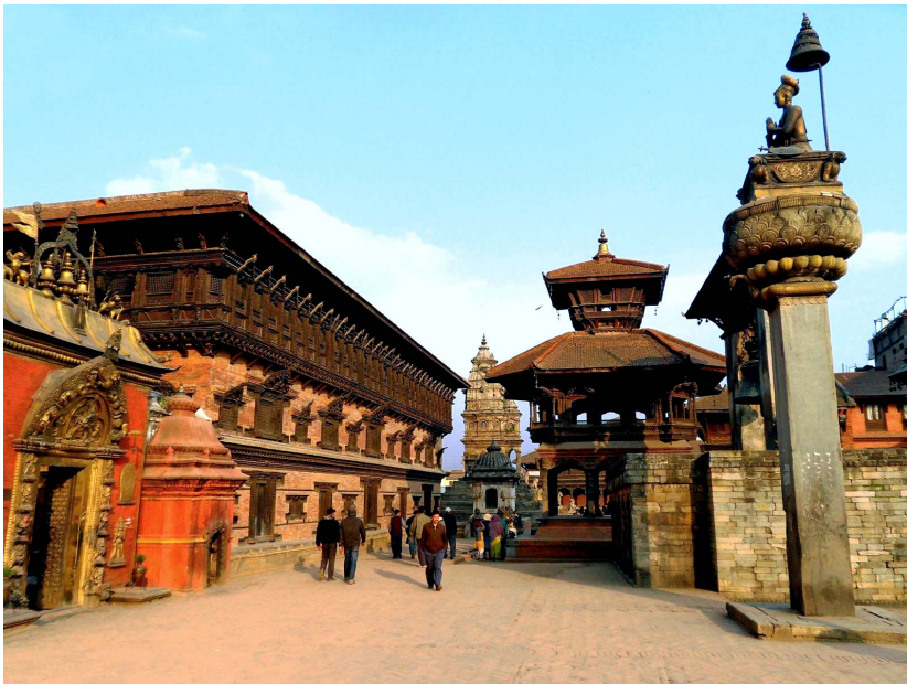
Figure 2: You have to write the caption and source like in figure 1.